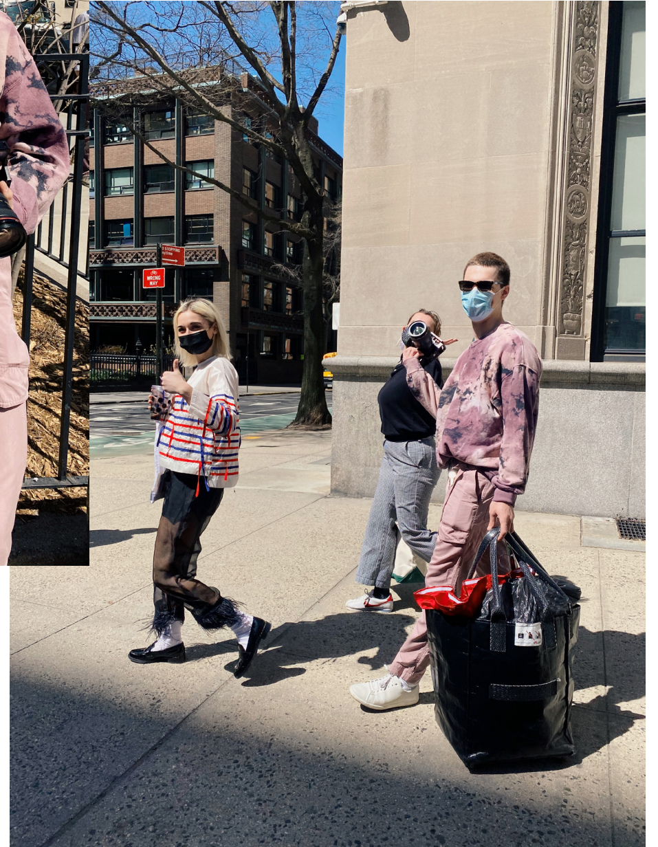
(Below) This large bag on wheels was our rig for carrying all of the costumes we needed, props and equipment.