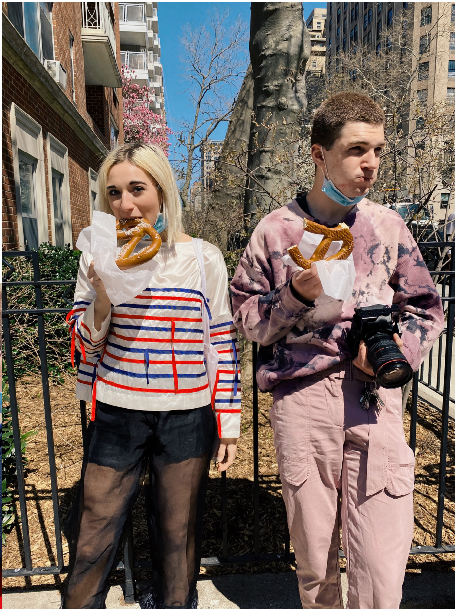
(Above) Our shoot was fueled by NYC streetcart meals.