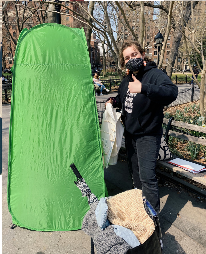
(Above and Left) Shooting in Washington Square Park, and featuring our makeshift changing station / "trailer", aptly named "the booger".